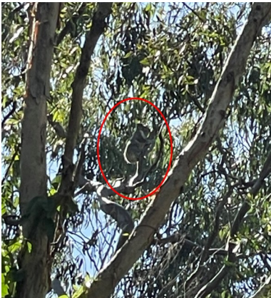
One of the local koalas in a gum tree on the College grounds. This tree is earmarked for removal if the current plan is approved

KAG has also approached the Federal government asking for the proposal to be called in and assessed under the EPBC Act. Ormiston College do not intend to refer the project for assessment, with their ecological report incredulously citing there will not be a significant impact on koalas.