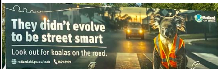
Billboard at Wellington St, Ormiston

For further info: https://www.redland.qld.gov.au/info/20301/koala_conservation/913/koala_conservation_plan