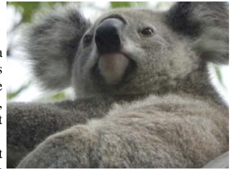
Toondah Koala - GJ Walter Pk 28/4/24

This effectively means that another development application can be put forward with intensive development on the land portion of the Toondah Harbour Precinct which would still have devastating impacts on the koalas that call the area home.