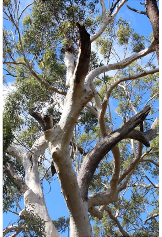
An example of a 'veteran' eucalyptus tree in the Redlands