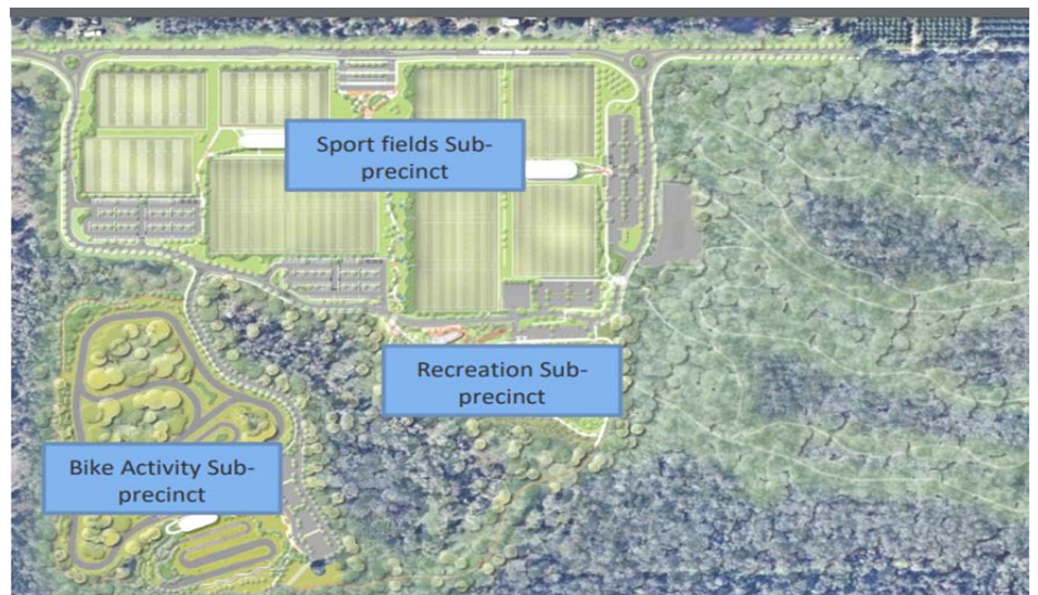
Heinemann Rd Sport and Recreation Precinct masterplan (May 2020)

Additionally, the pair of breeding wedgetail eagles on the site will inevitably be disturbed by the future development of the sporting and recreation precinct.