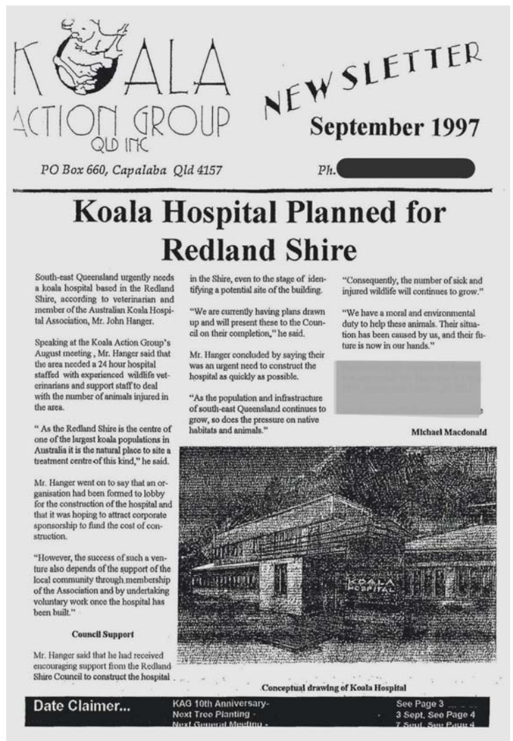
Front page of KAG newsletter- Sept 1997

Our group looks forward to having constructive involvement in progressing this proposal that will help support all wildlife in the Redlands.