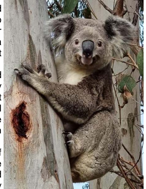
Maggie's release in April 2023

This is a great example of collaboration between neighbours to monitor and look out for the wellbeing of local koalas.