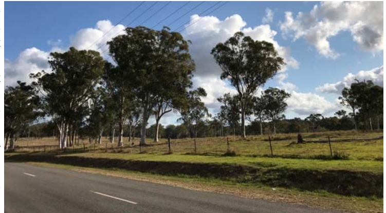
These large trees are some of the hundreds of koala habitat trees that will be bulldozed under Council's plan

However, it appears our suggestions have been largely ignored and disappointingly this has resulted in the planned loss of significant koala trees and habitat vital for other wildlife.